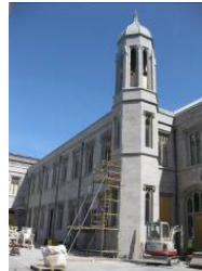
One of many granite towers which has been cleaned and brought back to its former glory

On a lovely sunny lunchtime following a quick sandwich lunch, courtesy of the contractor McAlpine Construction, we set out on an in-depth exploration of the almost completed renovation of Marischal College.