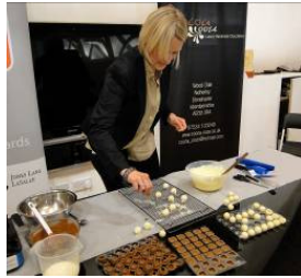
There's no such thing as free chocolate! Members got the chance to try their hand at truffle-making