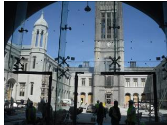
The internal courtyard seen through the newly installed structural glazing