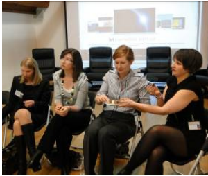
As well as learning the tricks of the chocolate trade, members got to indulge in the sweet treats on offer!